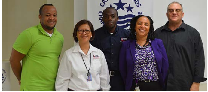
Representatives from ESO facilitated one of three sessions in 2016.

The Chamber began work on a series of educational & informative videos on why economic growth is important for the Cayman Islands. We partnered with a series of corporate supporters, including Ernst & Young, and an animation company to begin work on the videos. At the Legislative Luncheon in October we presented the first video. The Marketing & Communications Committee also began work on establishing a marketing campaign for when all videos are completed, which should occur in early 2017.