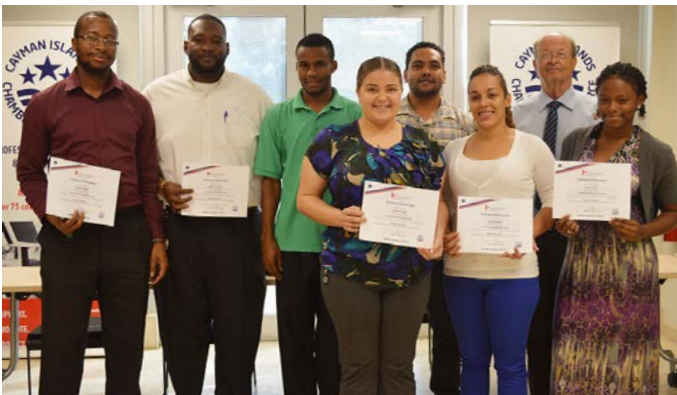
Hundreds of registrants improved their skills at our training centre.