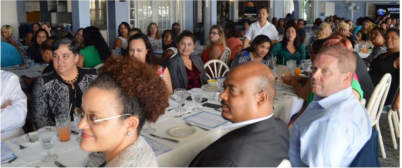
Members of the Chamber Council were present to celebrate Cayman's inaugural Women's Entrepreneurship Day.