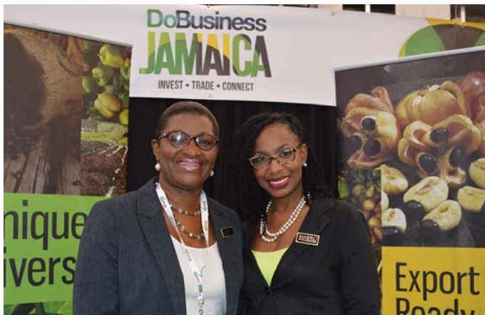
Delegates from across the region attended the Marketplace Expo.