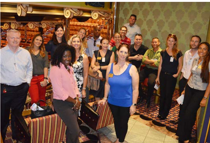
The 2016 Leadership Cayman Class pose for a photo, whilst Mentoring Cayman class members graduate (right).

There were two Chamber Golf Classic Tournaments during 2016. The first took place on April 8, and this was the postponed 2015 Tournament. The second took place on November 4. The April Tournament saw 13 total sponsor