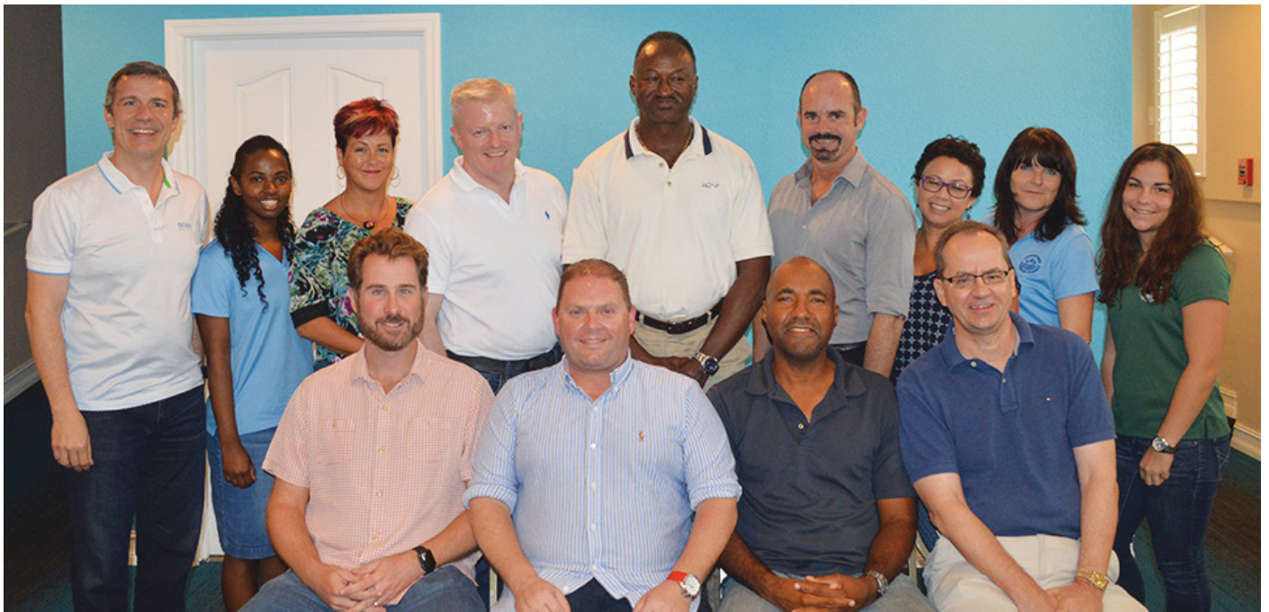
The Chamber Council & staff met to create the 2016-18 Strategic Plan.

We will continue to adhere to our Strategic Plan throughout 2017, and we are confident that we can achieve even more in the coming year.