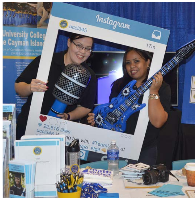
UCCI were one of many supporting members at the 2016 Careers Expo.

Approximately 1,500 volunteers assisted in 2016's Earth Day Clean-up. 31 corporate sponsors supported the community enriching environmental event. All volunteers were invited to enjoy a delicious breakfast at Public Beach once the clean-up had concluded.