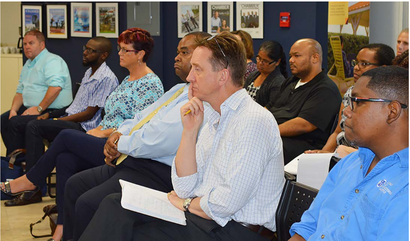
Dozens of individuals benefited from our BE INFORMED sessions.

The Chamber ran three successful Be Informed sessions throughout 2016. In May, we invited ESO to explain the importance of their Business Survey, and the procedures on how to complete it. We then invited Government representatives to the Chamber to discuss the Ready2Work Initiative – a newly formed initiative which is designed at assisting unemployed Caymanians find steady, long-term work. Our final session focussed on the important changes to Intellectual Property Rights. Combined, over 80 individuals benefited by attending these sessions.