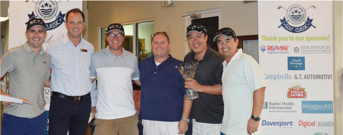
The Walkers team emerged victorious from our postponed 2015 Classic.