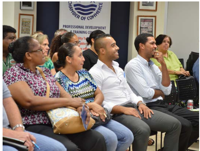
Hundreds of people benefited from our workshops.