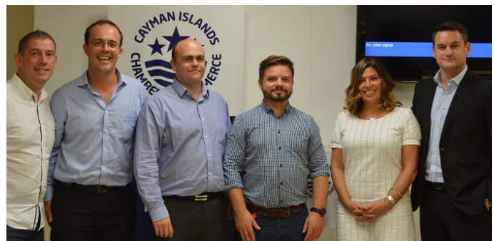
Digicel facilitated one of 12 SME workshops in 2016.

The Chamber – in partnership with the Ministry of Financial Services, Commerce & Environment - ran 12 successful SME workshops during 2016. The workshops covered a variety of topics to support small-and-micro enterprises in the country – including social media tips, financial planning advice, and telecommunications support. Hundreds of attendees benefited from the expertise of our guest facilitators. The contract was renewed by the Ministry, extending the partnership into 2017.