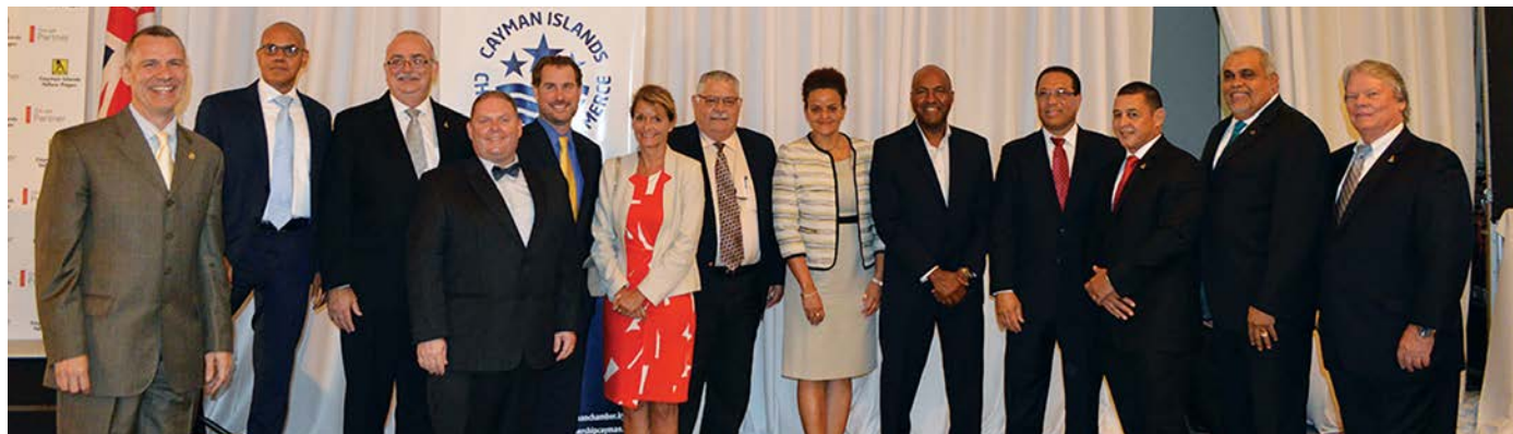
Chamber council members joined Her Excellency The Governor, The Premier, and other members of the Legislative Assembly at the Legislative Luncheon.