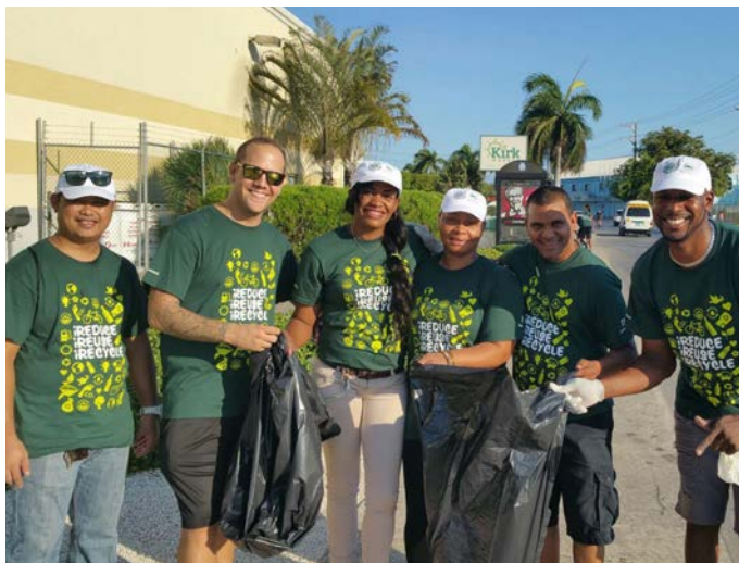
One of the dozens of volunteering clean-up teams.

The Caribbean Week of Agriculture (CWA) was celebrated in the Cayman Islands for the first time in 2016. In partnership with the Ministry of Agriculture, the Chamber helped to organise and host the Marketplace expo. The event was held at the ARC in Camana Bay and saw delegates & representatives from around the Caribbean in attendance, including: Jamaica, Honduras, Dominica, Belize, and more. The event served as an excellent way for Caymanian businesses to network with their Caribbean neighbours, and brought each business some valuable recognition from the Cayman Islands community.